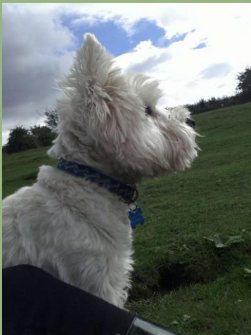
Bradley enjoying the view on our walk.