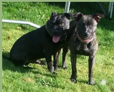
JD & Lexi having a cuddle.

JD is a 6 year old Staffordshire Bull Terrier (pictured above) who first came to stay in November and Lexi (my puppy) and him hit it off straight away. It's fair to say it was love at first sight. JD is a lovely character he loves to play and loves to be cuddled. JD & Lexi spent all their time playing so much so I