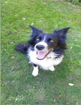
Cheeky Max after a long walk.

As some of you many know I am staying behind this Christmas to sit some of your lovely pets.