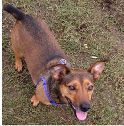
DOG OF THE MONTH: FEB 2015 Bertie (Pic Above) Bertie & Friends (Right)

Dog of the month goes to.... Bertie "Jack Russell"